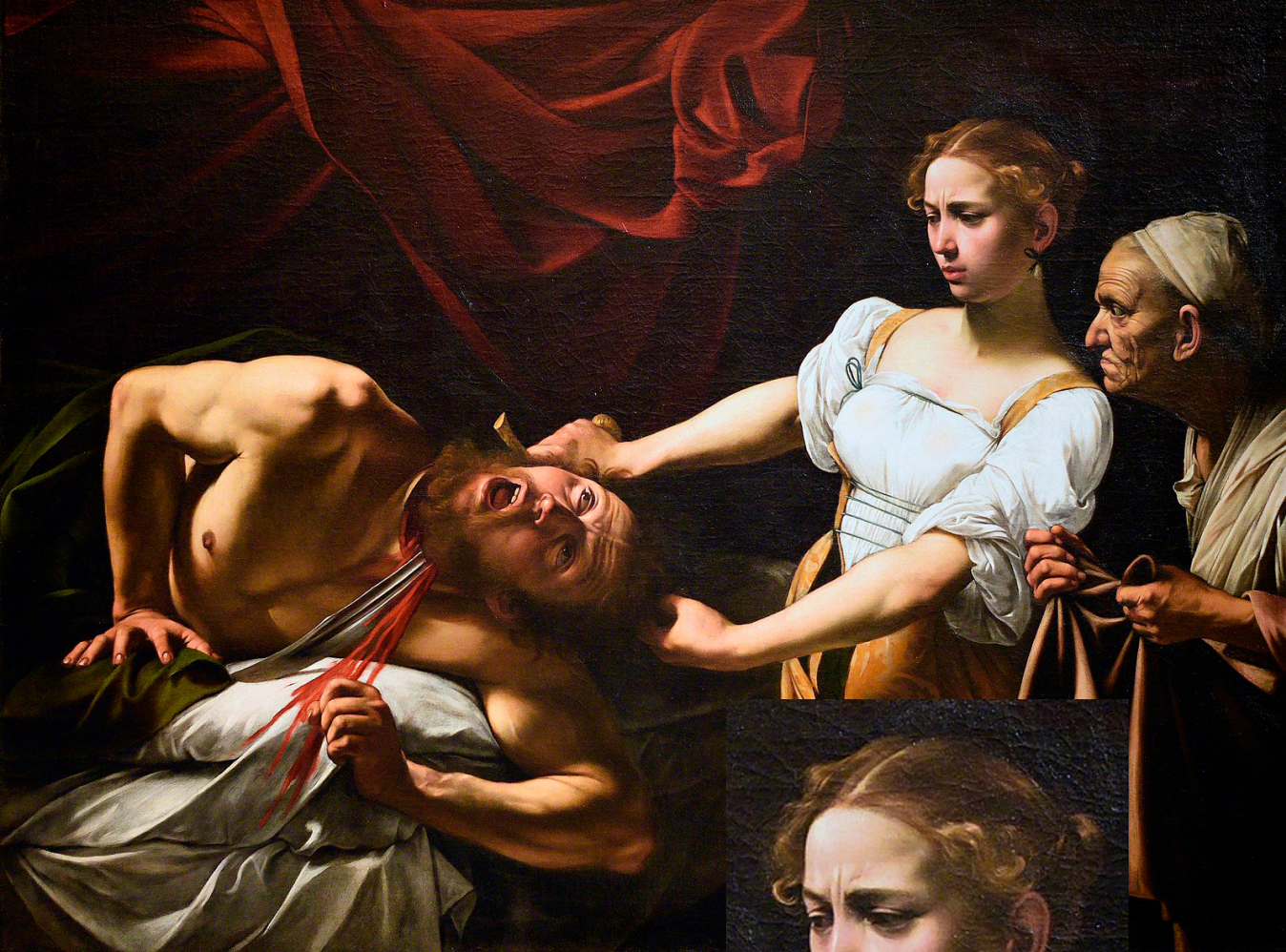
Caravaggio - Judith Beheading Holofernes (ca. 1598/99) — 145cm x 195cm